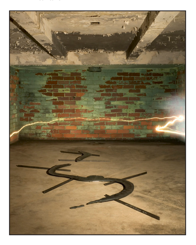
Figure 3. Permornance art installation.

Of thorns and steel and ink, I commit this work to ordinary time, to ordinary people, to ordinary passage. – Incantare