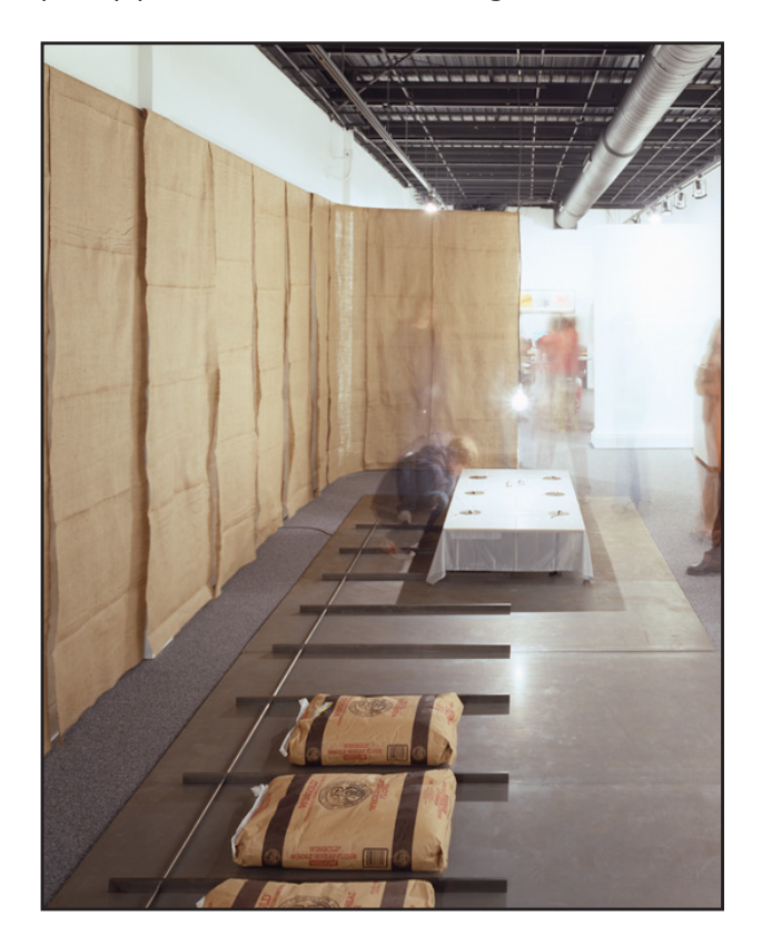
Figure 2. Abstract inventory.

That individual experiences vary with respect to their context is well known among those engaged with the conception and enactment of works based in human occupation. This variation in response to environment derives from our interpretation of the items of experience (phenomena) and their material arrangement. Cross-culturally, perceptual readings of context correlate with reflective and anticipatory processes of understanding.